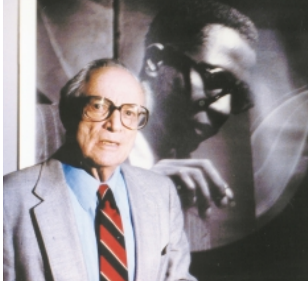
Pianist and composer Thelonious Monk was among the jazz immortals that William Gottlieb photographed. Gottlieb's photo portraits appear on four U.S. postage stamps.

In 1948 I quit jazz, cold. The nation was in a recession. The big swing bands were dying. And 52nd Street was being devastated by drugs and by the sounds of bop, to which older musicians and their fans couldn't