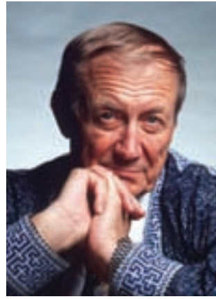
Sergei Khrushchev & Yevgeny Yevtushenko